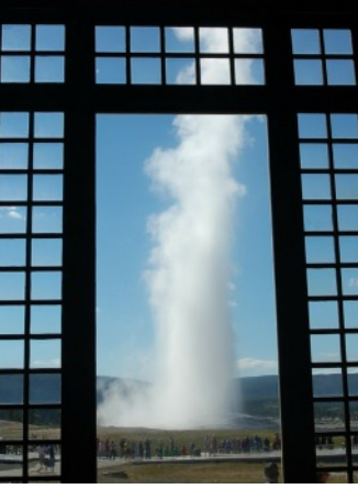
Old Faithful, as viewed through the window of the Old Faithful Lodge

July 13 brought this wonderful adventure to a close. We started the day as we began so many others with coffee percolating on our one burner Coleman stove and a cup of coffee at the campsite. It was now time to break camp and head for home. It has been a wonderful vacation. We were away for 44 days and traveled 7783.5 miles, using 307 gallons of gasoline.