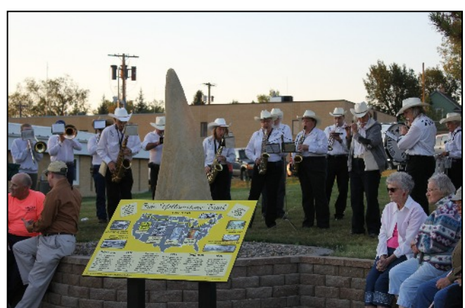
The Hettinger Cowboy Band in full regalia performs on the rise of lawn immediately behind the newly installed, original sandstone obelisk that served as one of the Yellowstone Trail markers in the Adams County area.

It exists today, as US Highway 12, the only place in North Dakota through which the Yellowstone Trail ran. \Psi