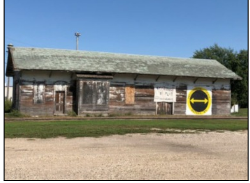
Former railroad depot in Watson, Minnesota

The recent YT Marker painted in Watson Minnesota is 10 feet by 10 feet, bright yellow and black with a twist. The arrow goes both ways. The