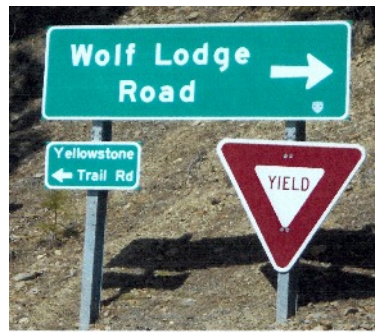
YT Route near Coeur d'Alene, Idaho