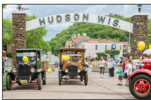
The Hudson Gateway Arch, entrance to the causeway that originally led to the now removed toll bridge.