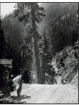
Blewett Pass in 1920

At Scotty Creek the old wagon-road follows National Forest Road No. 7324 to where it meets the 1922 road, now National Forest Road No. 7320. Continued