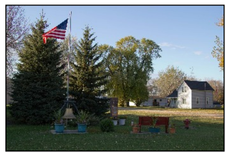
Odessa Town Park

No single event made a bigger impact on the citizens of Odessa than the disastrous train wreck on December 18, 1911, at 4:28 a.m., when a new all-steel train of the Chicago, Milwaukee & St. Paul Railroad, carrying silk worms, crashed into the rear of a Columbian Flyer bound for Chicago. The silk train was traveling at 70 miles per hour around a curve when the engineer saw the passenger train standing on the tracks. The engine crushed the sleeper car, killing twelve passengers and injuring another dozen. The sound of crushing steel awakened the community who rushed to the aid of the injured. Three more train accidents occurred over the next sixty years, but none as dramatic as the crash of 1911.