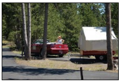
Camping near Yellowstone National Park

The scenery on this stretch of roadway is spectacular. That night we camped at a state campground along the river.