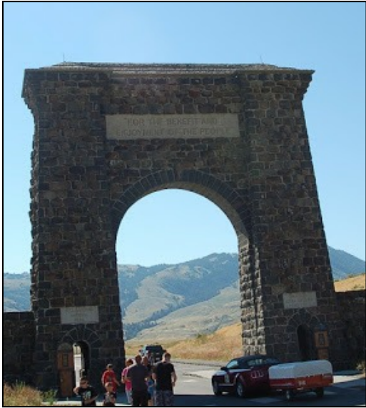
Roosevelt Arch at Gardener's North Entrance

The Northern Pacific carried well-to-do easterners to the park, which was advertised heavily in Eastern papers and magazines. It billed Yellowstone and other parts of the Pacific Northwest as "Wonderland". None of this diminishes the national parks' position in American history or Yellowstone's place as the crown jewel in America's national Park system.