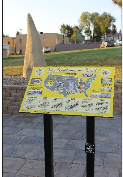
Funded by the national Yellowstone Trail Association, the historical sign with the map stands to the east side of the recently dedicated historical area on the southeast corner of Adams County's Courthouse lawn.

citing the importance of volunteerism in community life.